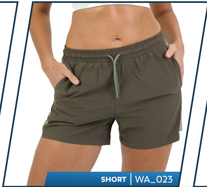
SHORT | WA_023