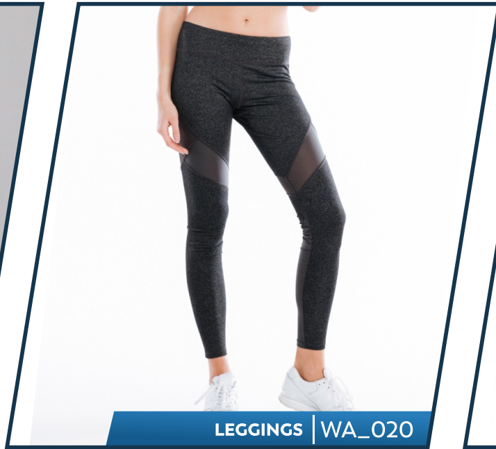
LEGGINGS | WA_020