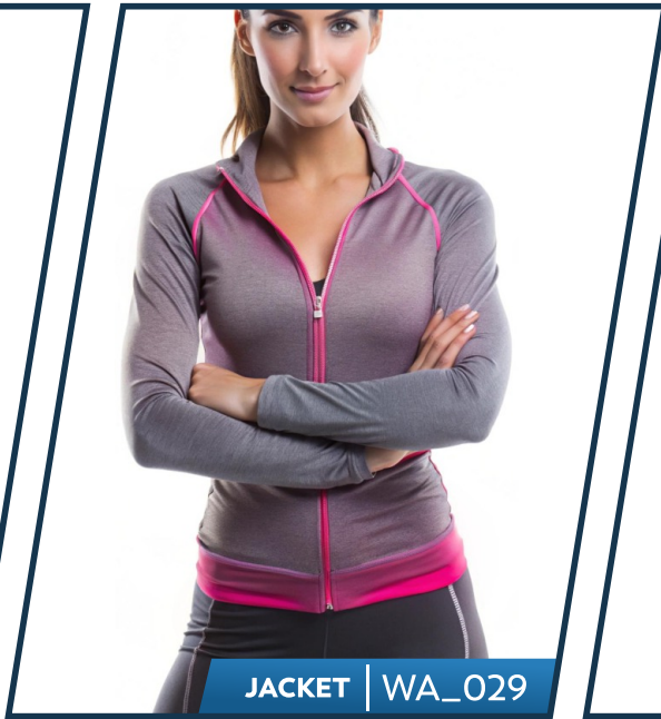
JACKET | WA_029