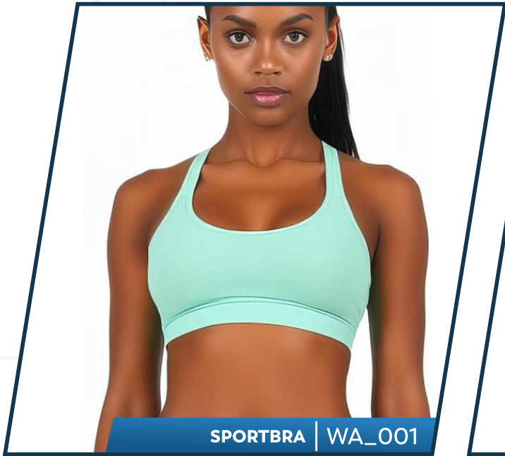
SPORTBRA | WA_001