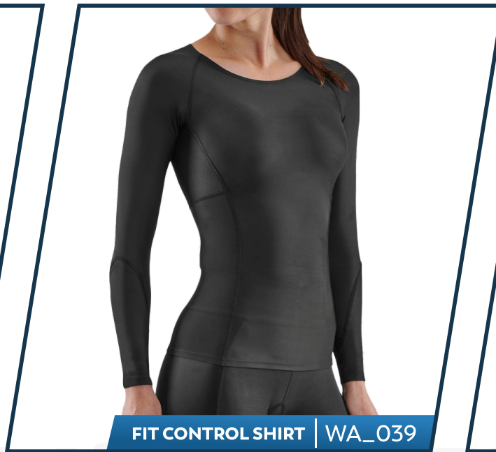
FIT CONTROL SHIRT | WA_039