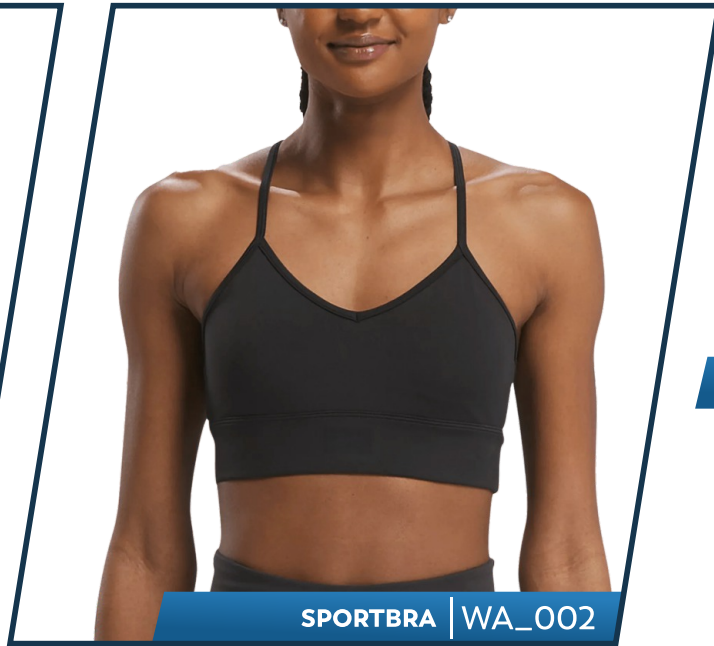
SPORTBRA | WA_002