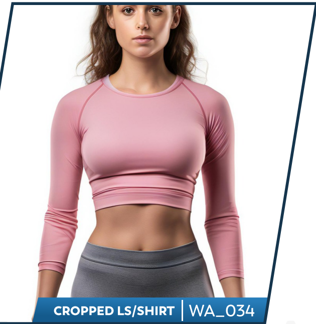
CROPPED LS/SHIRT | WA_034