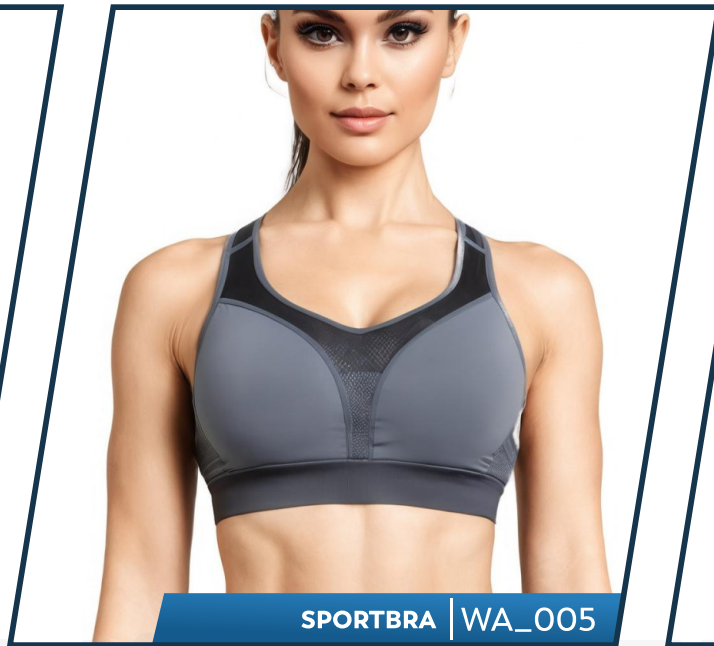
SPORTBRA | WA_005