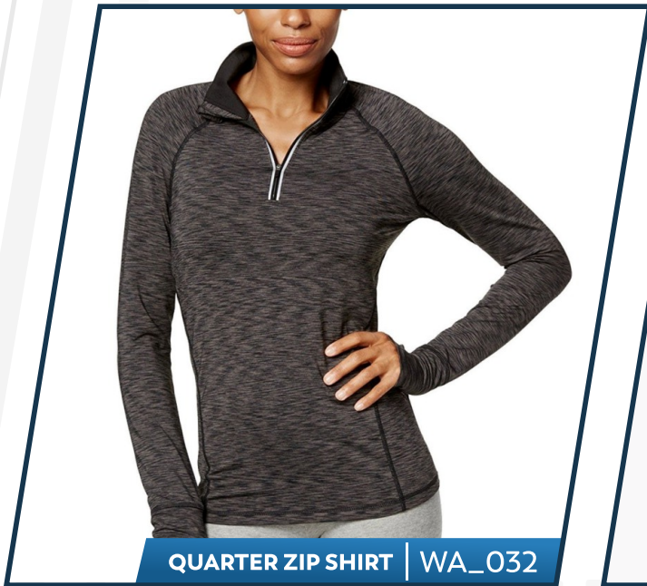
QUARTER ZIP SHIRT | WA_032