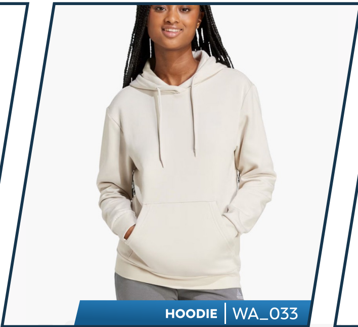
HOODIE | WA_033