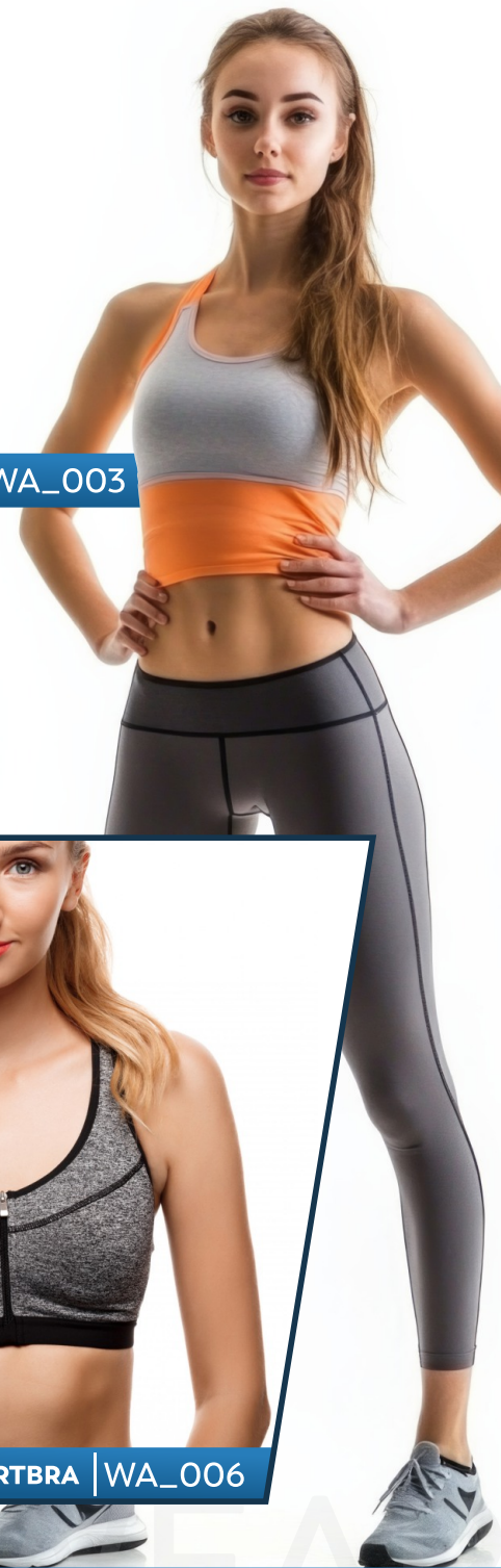
SPORTBRA | WA_003