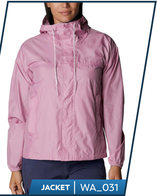
JACKET | WA_031