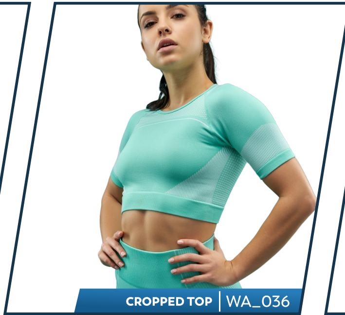
CROPPED TOP | WA_036