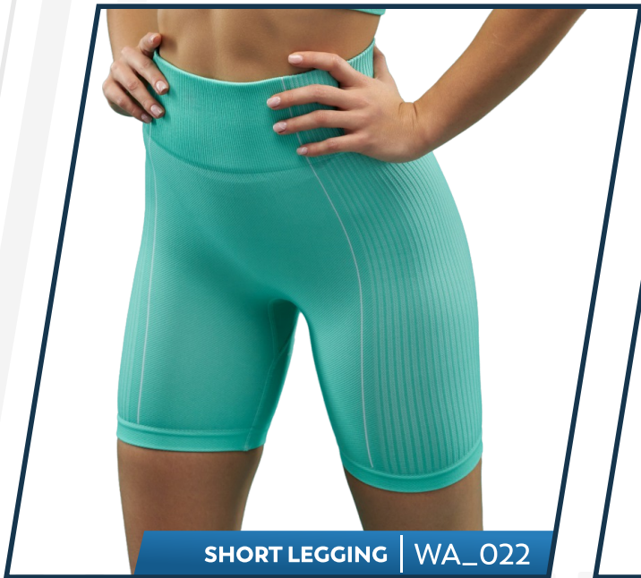
SHORT LEGGING | WA_022