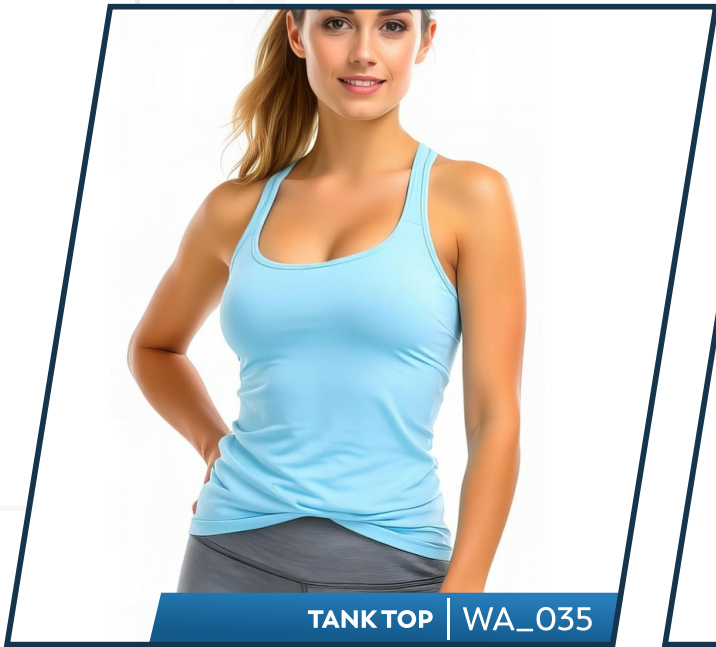
TANK TOP | WA_035