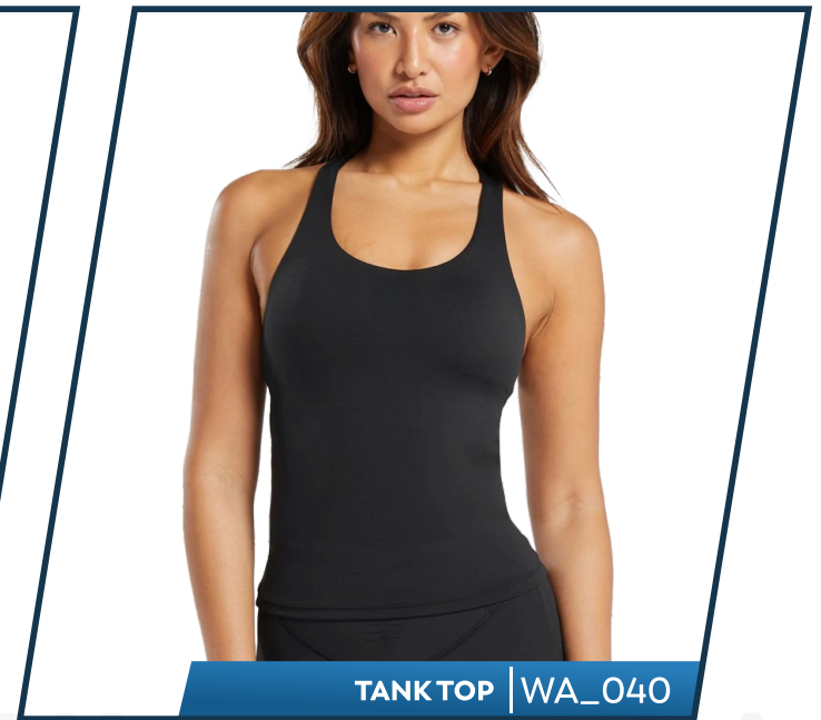
TANK TOP | WA_040