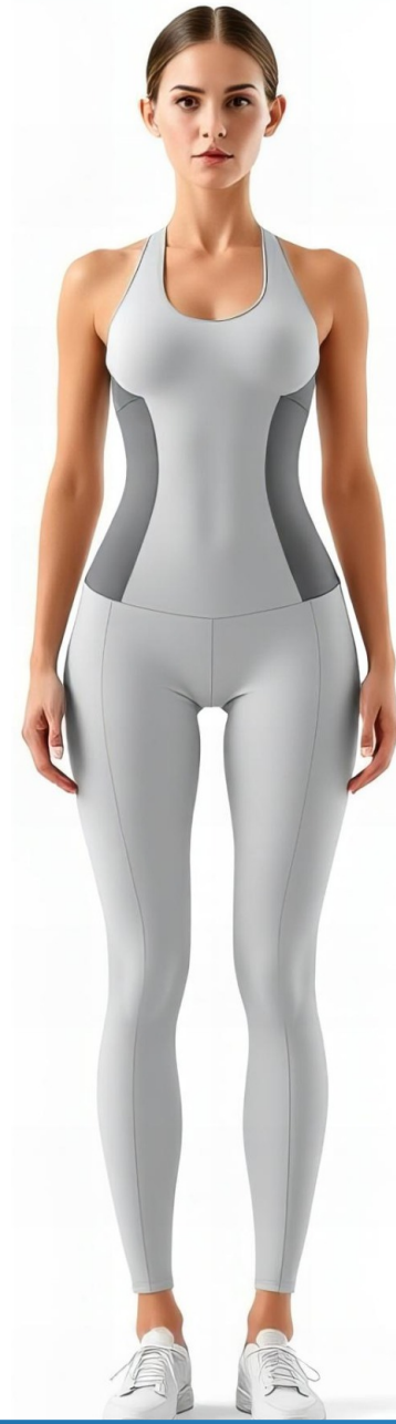
TRACKSUIT | WA_027