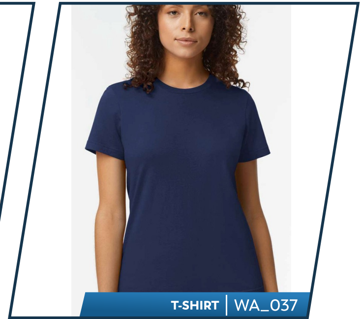
T-SHIRT | WA_037