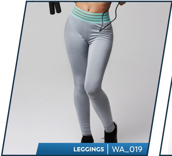
LEGGINGS | WA_019