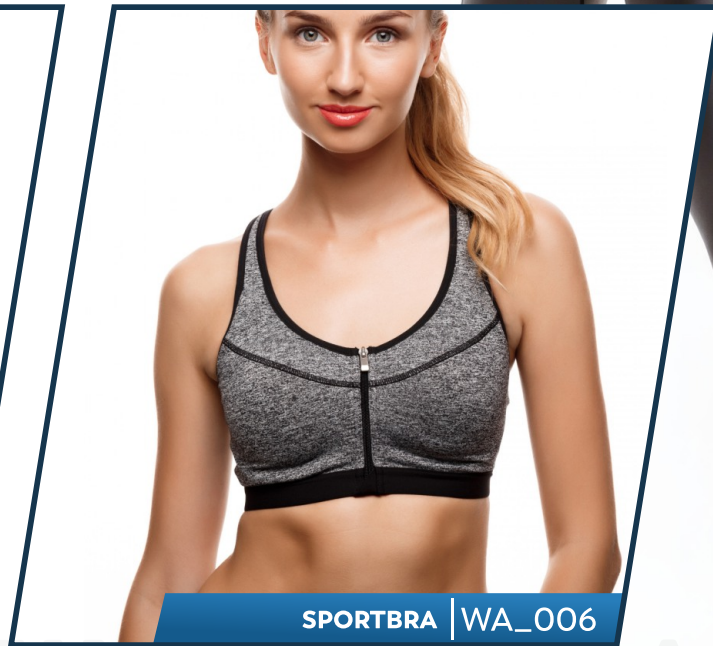
SPORTBRA | WA_006