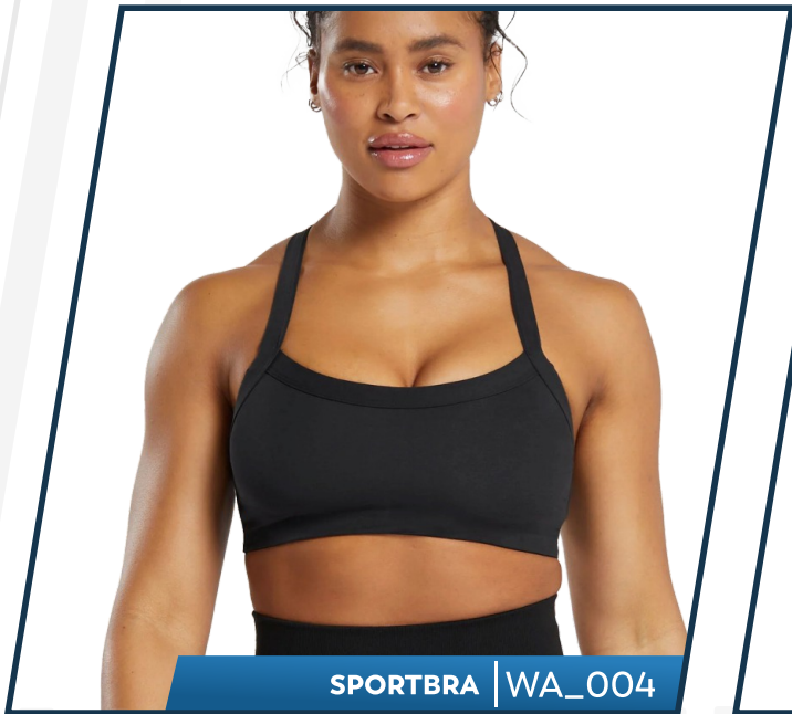
SPORTBRA | WA_004