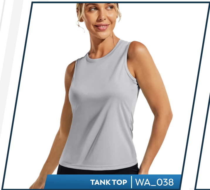
TANK TOP | WA_038