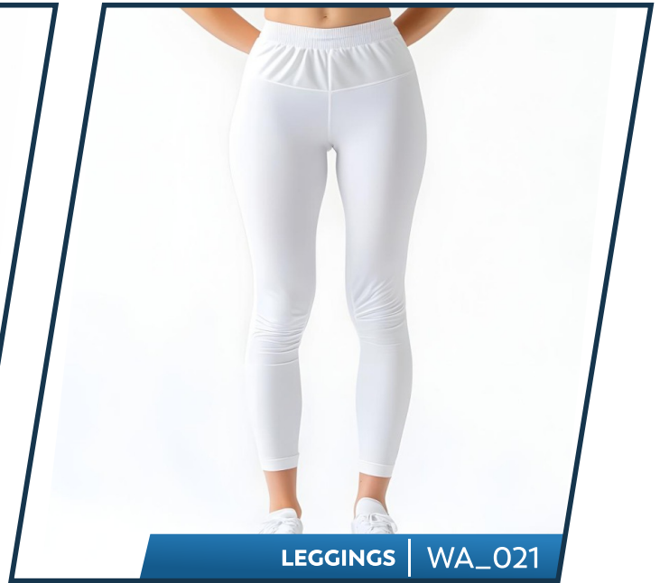
LEGGINGS | WA_021