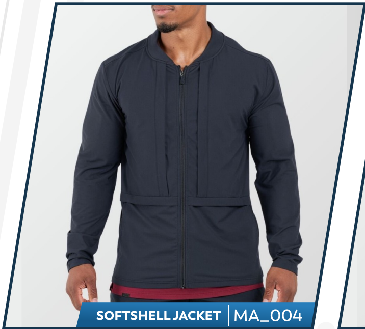
SOFTSHELL JACKET | MA_004