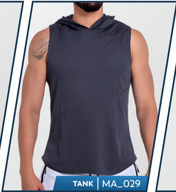
TANK | MA_029