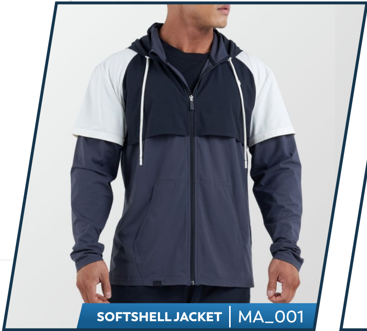
SOFTSHELL JACKET | MA_001