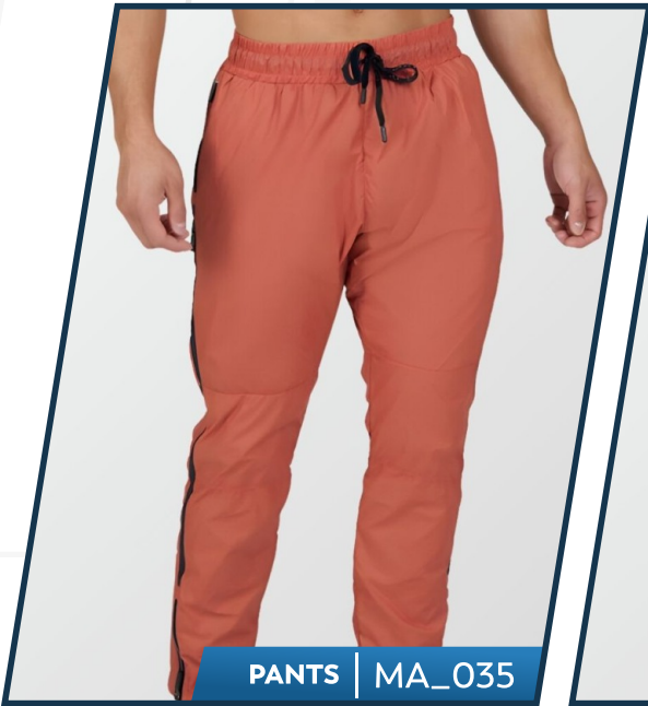
PANTS | MA_035