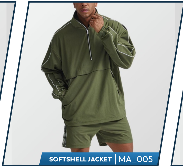
SOFTSHELL JACKET | MA_005