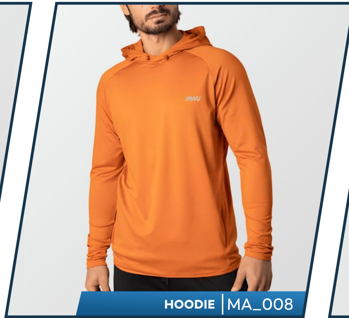
HOODIE | MA_008