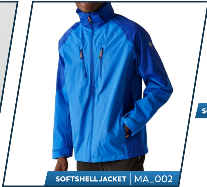
SOFTSHELL JACKET | MA_002