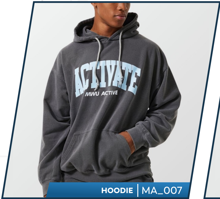
HOODIE | MA_007