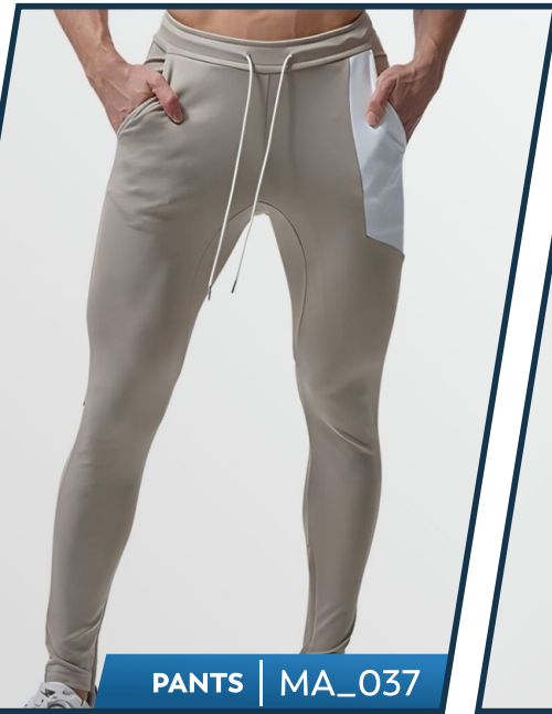
PANTS | MA_037