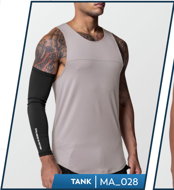
TANK | MA_028