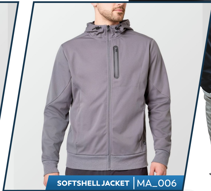
SOFTSHELL JACKET | MA_006