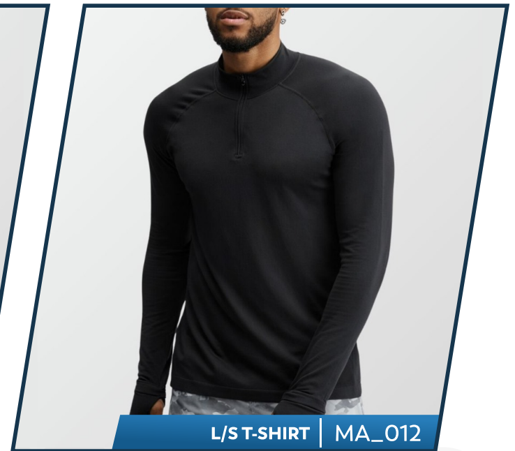
L/S T-SHIRT | MA_012