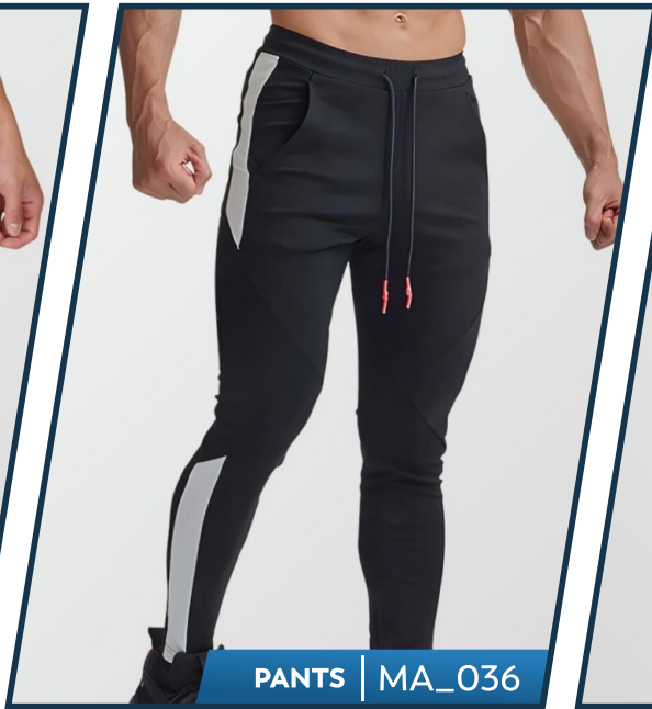
PANTS | MA_036