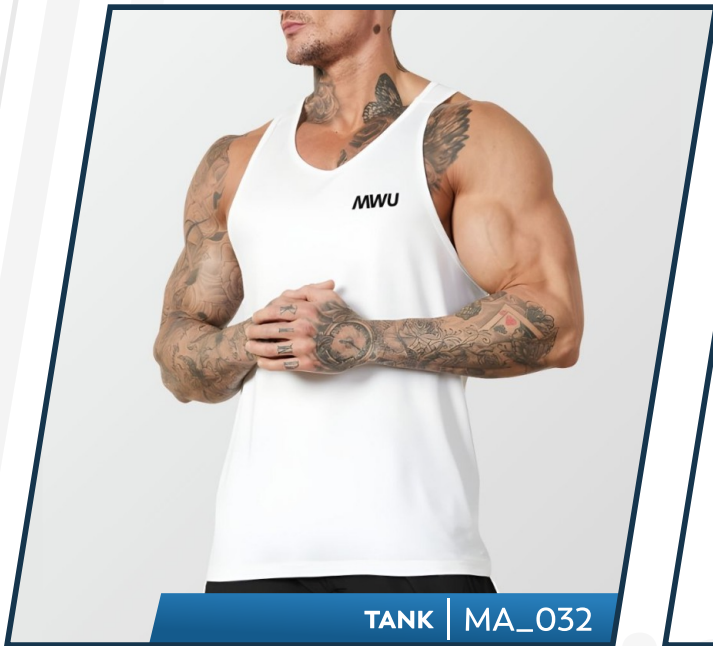
TANK | MA_032