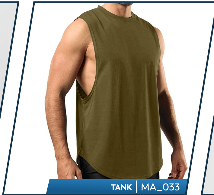
TANK | MA_033