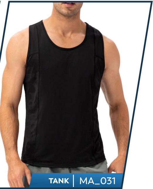
TANK | MA_031