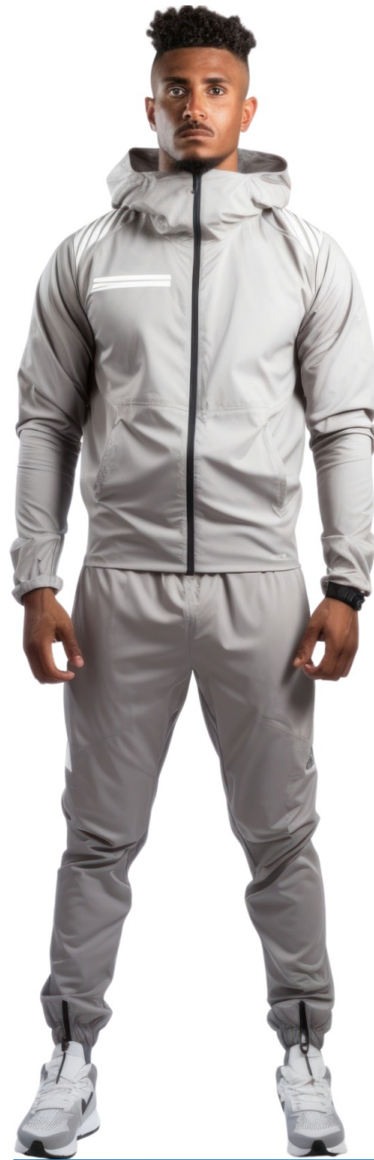
TRACKSUIT | MA_026