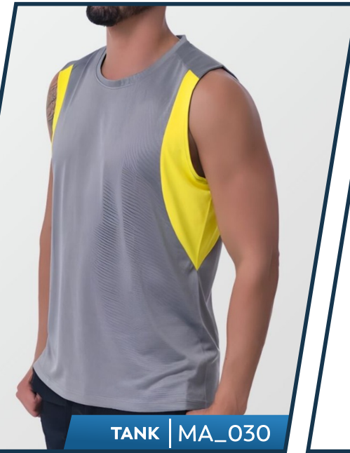
TANK | MA_030