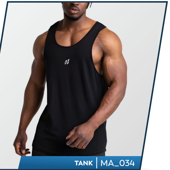
TANK | MA_034