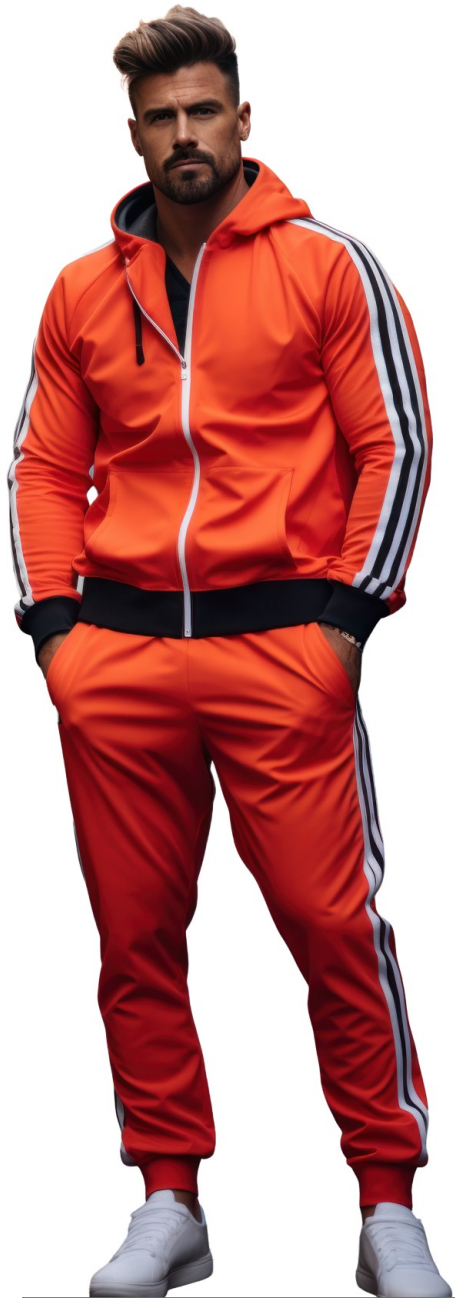
TRACKSUIT | MA_025