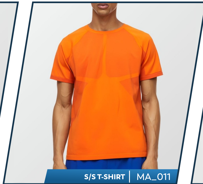
S/S T-SHIRT | MA_011