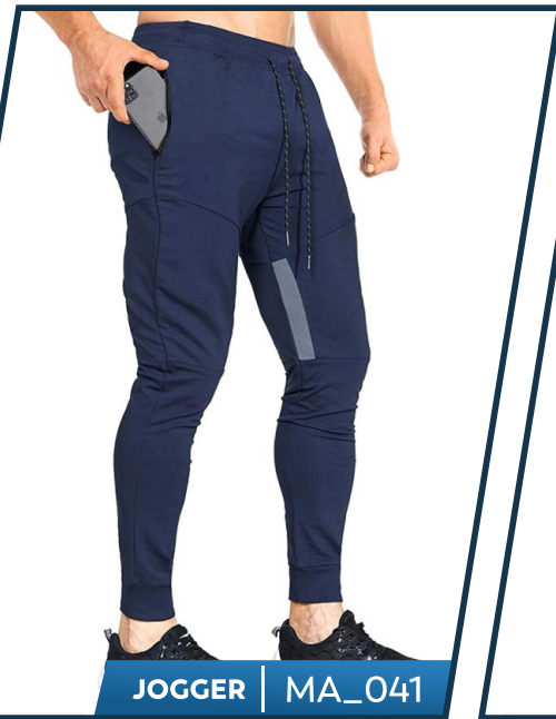
JOGGER | MA_041