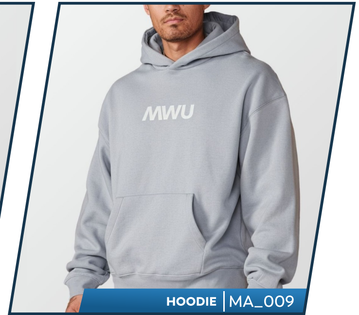
HOODIE | MA_009