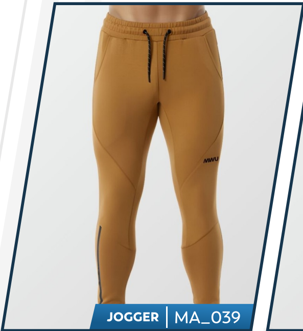
JOGGER | MA_039