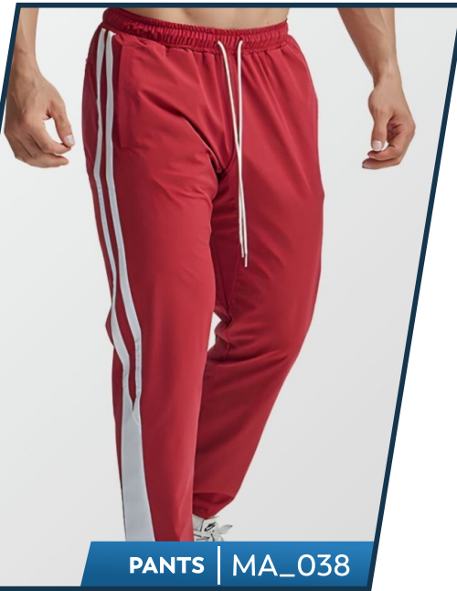
PANTS | MA_038