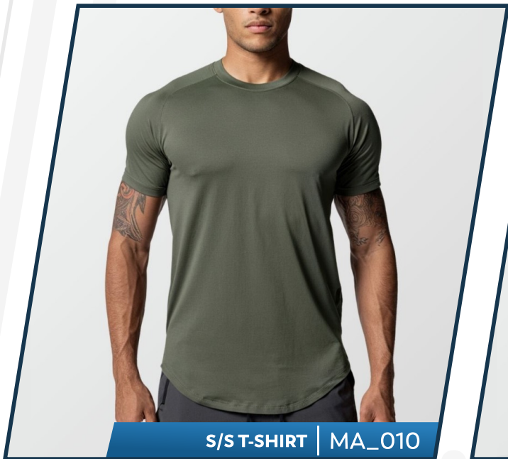
S/S T-SHIRT | MA_010