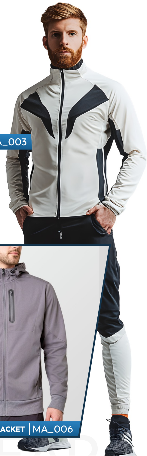
SOFTSHELL JACKET | MA_003