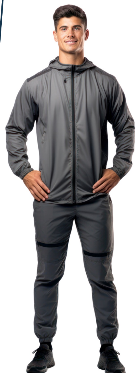
TRACKSUIT | MA_027