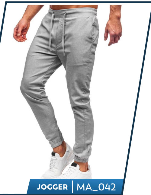
JOGGER | MA_042