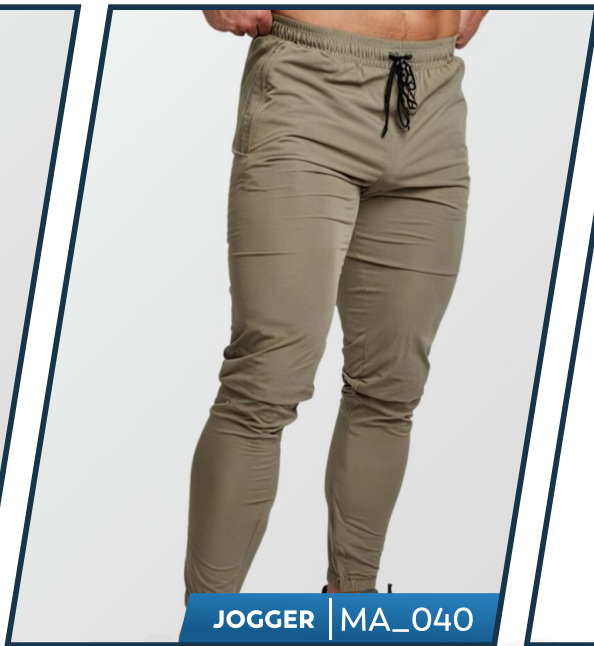
JOGGER | MA_040