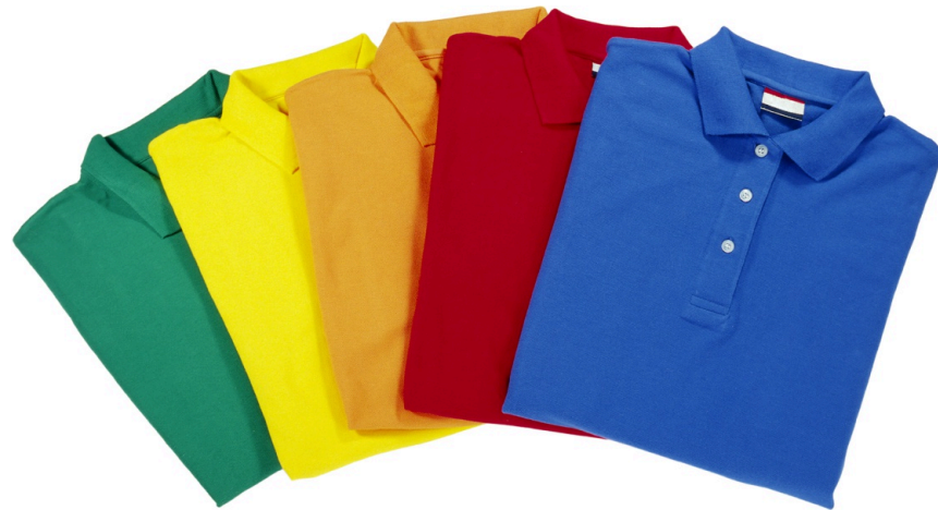
POLO SHIRT | FD_011