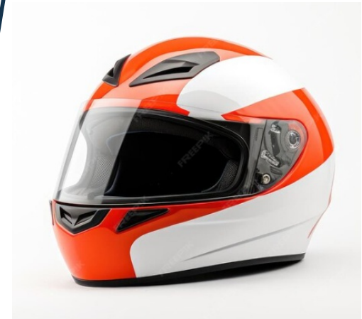
HELMET | FD_017