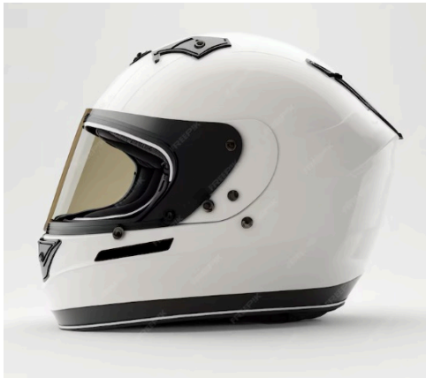
HELMET | FD_015