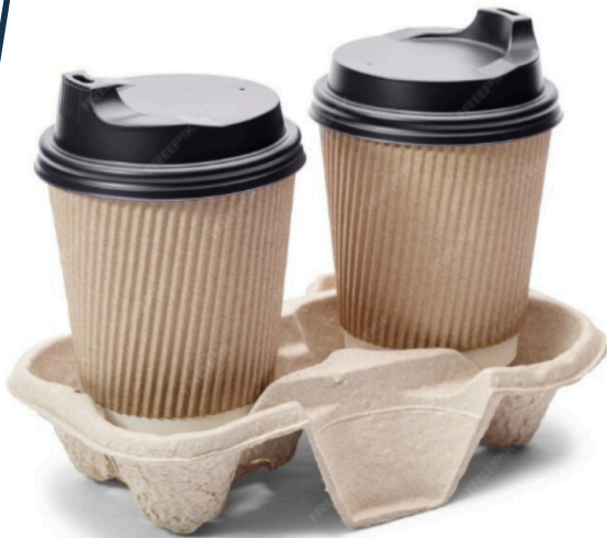
DISPOSABLE CUP | FD_019