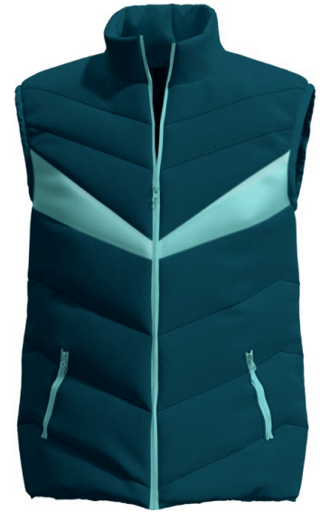
VEST | FD_009