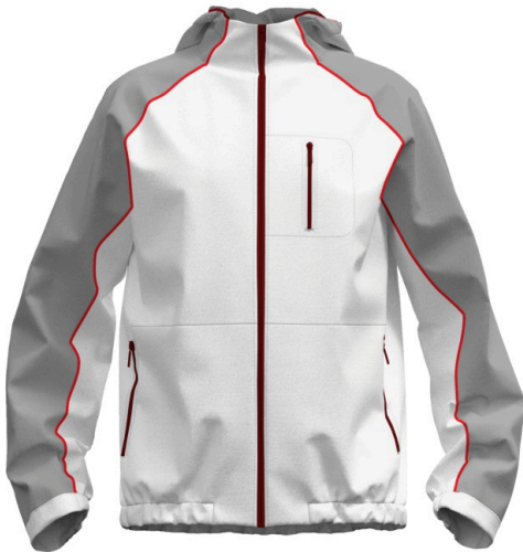
SOFTSHELL JACKET | FD_010