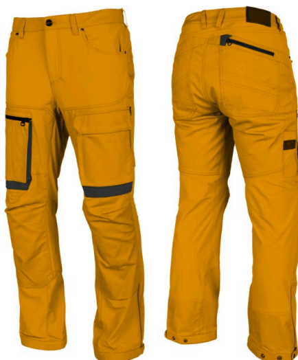
JOGGER PANTS | FD_005