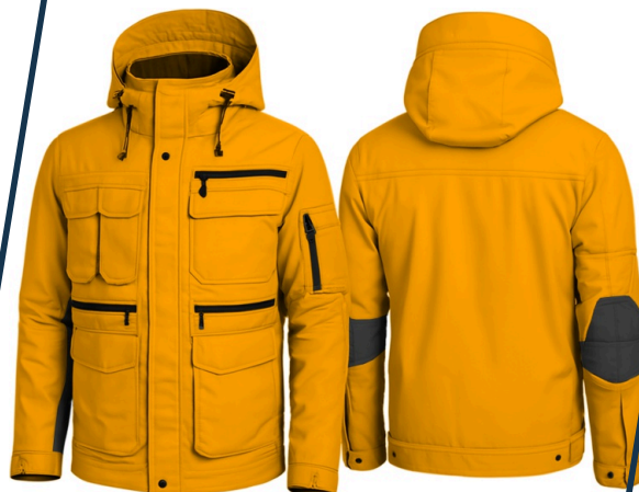
JACKET | FD_002