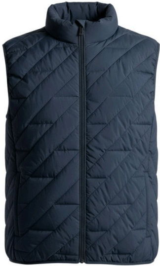
VEST | FD_007