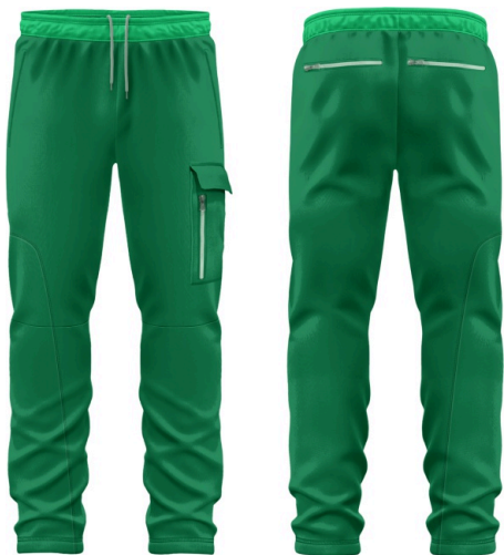
JOGGER PANTS | FD_004