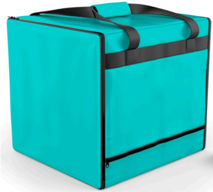
DELIVERY BAG | FD_012