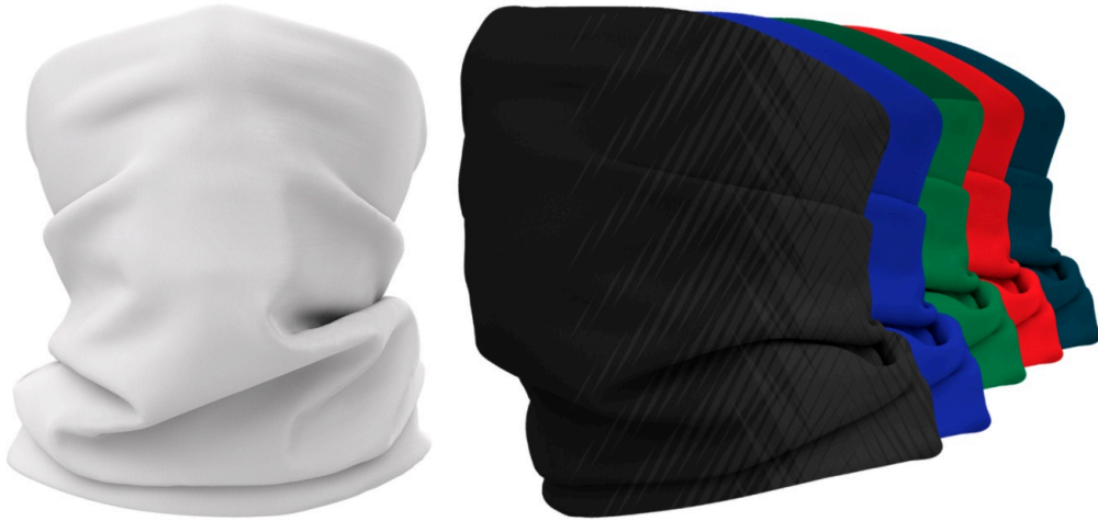
BANDANA | FD_018