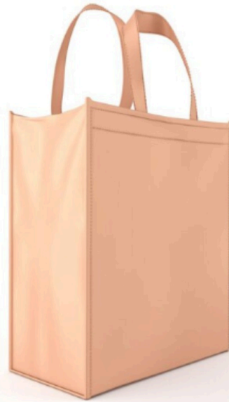
TOTE BAG | FD_020