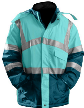
JACKET | FD_001