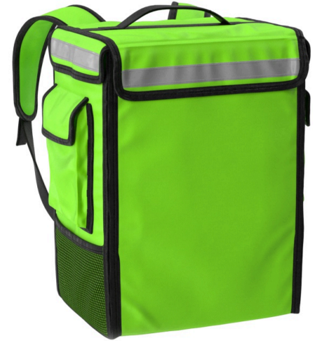
DELIVERY BAG | FD_014