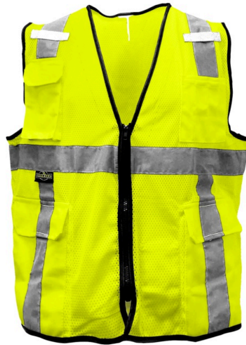
VEST | FD_008