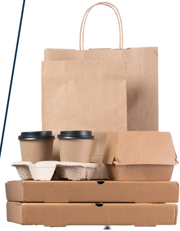
DISPOSABLE ITEMS | FD_021