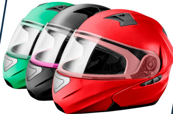
HELMET | FD_016