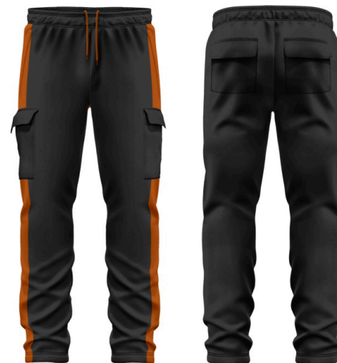
JOGGER PANTS | FD_003