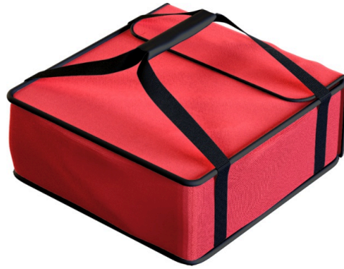
DELIVERY BAG | FD_013