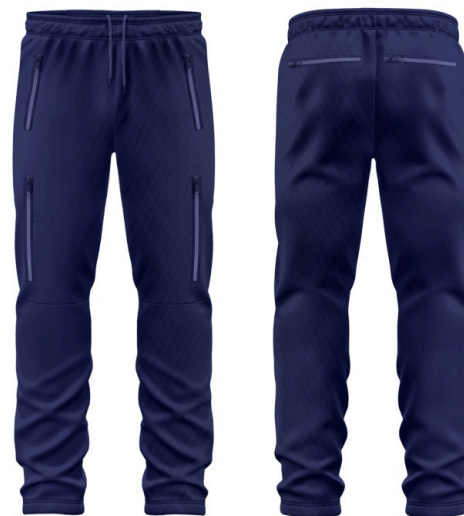
JOGGER PANTS | FD_006